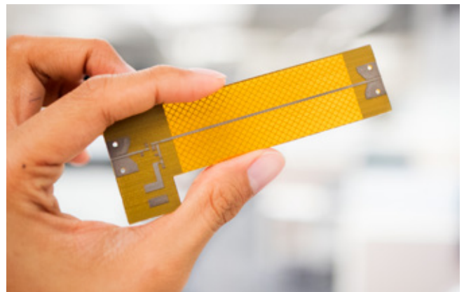
3D Printed PCB